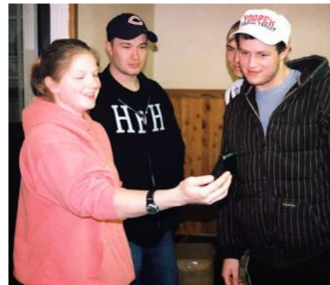
Criminal Justice students participate in Standardized Field Sobriety Testing training April 8