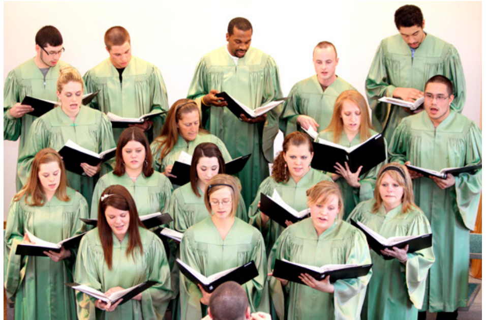
The Finlandia University Singers perform in the Chapel of St. Matthew April 22