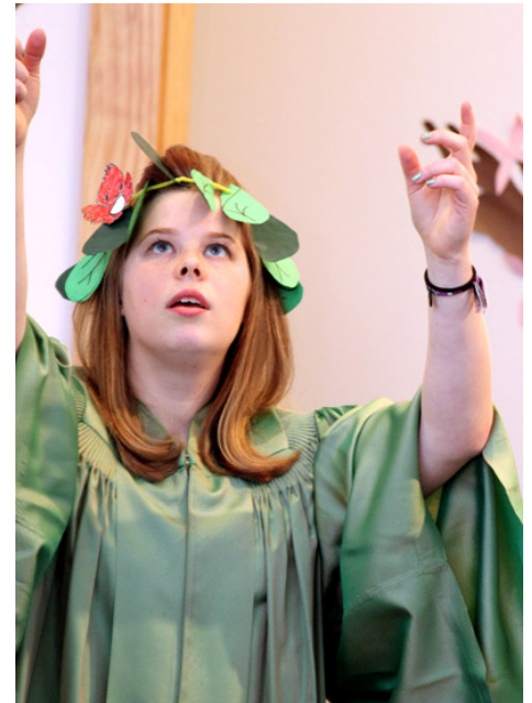
A student performs in the children's musical, "A Tale of Three Trees"

much you have all done, and how well you have performed your duties! WELL DONE, GOOD AND FAITHFUL SERVANT LEADERS!