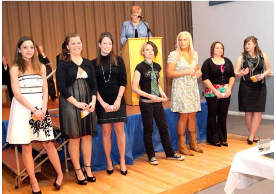
Some of the Class of 2010 Magna Cum Laude honors graduates