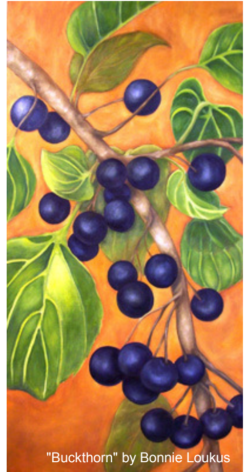
"Buckthorn" by Bonnie Loukus

"The material on which the deadly sins are drawn is made of delicate paper constructed with cicada wings, which represents the nurturing and