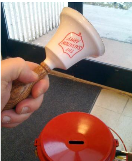
Campus Ministry collected donations for the Salvation Army December 3 at Goodwill, Houghton