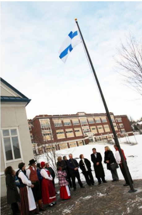
In honor of Finnish Independence Day, a Finnish flag is raised outside the Finnish American Heritage Center on December 1. The new flagpole and flag were donated to by the Finlandia University International Alumni Board.