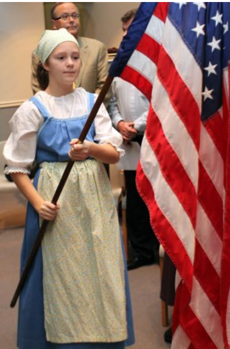
Above: A member of the Kivajat dance group bears the Finnish Flag at the December 1 Finnish Independence Day celebration