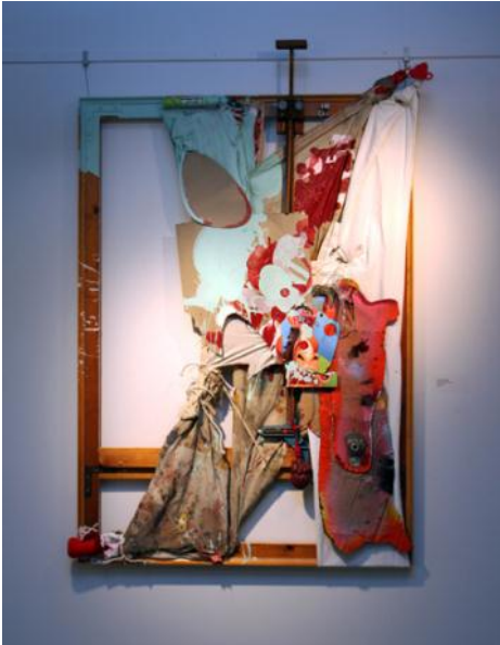
1st Place-Greg Green, "Martyrdom of St. Equine," mixed media