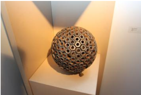
3rd Place-Dave Sarazin, "Sphere," repurposed hex nuts