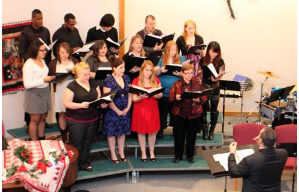
The Finlandia University Singers and the Finlandia Pride Pep Band presented a concert December 8 at the Chapel of St. Matthew