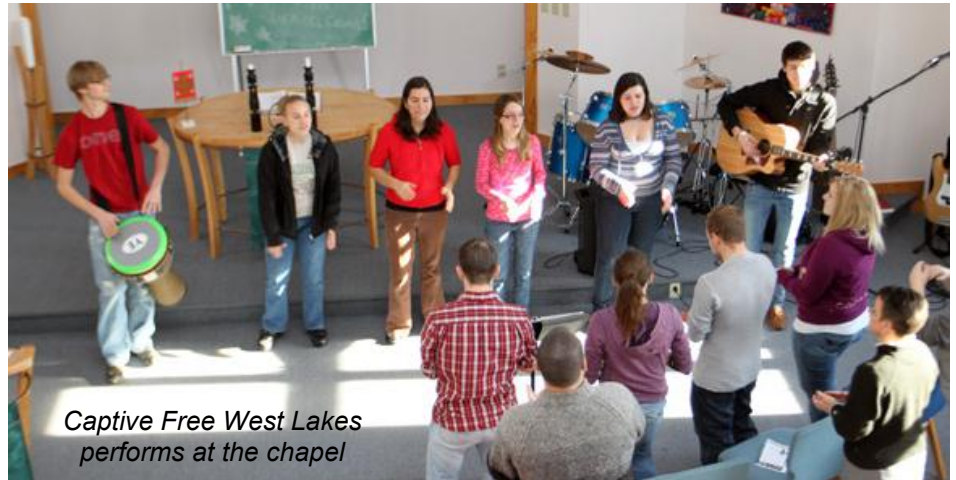
Captive Free West Lakes performs at the chapel