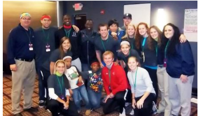
Finlandia student-athletes and coaches at the 2011 NCAA Leadership Forum in Chicago

I learned that to be a leader doesn't necessarily mean you are a