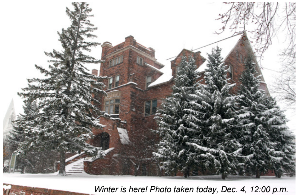
Winter is here! Photo taken today, Dec. 4, 12:00 p.m.

The gallery will be closed Dec. 23, 2009, to Jan. 3, 2010. Call 906-487-7500 for information.