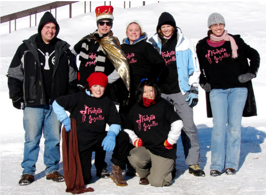
The winning Homecoming 2009 Obstacle Course Race team gathers for a photo January 30. It was darn cold that day, but this didn't appear to dampen their enthusiasm.