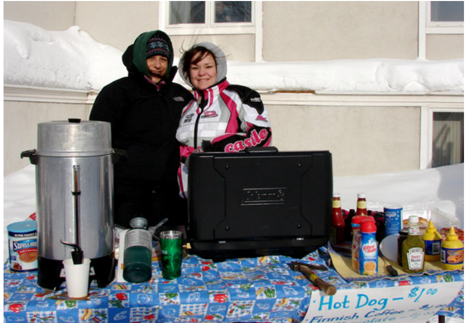
Above: Finlandia Connection students brave the frigid weather to sell hot dogs, coffee, and hot chocolate outside the Finnish American Heritage Center during Heikinpäivä, Saturday, January 24.