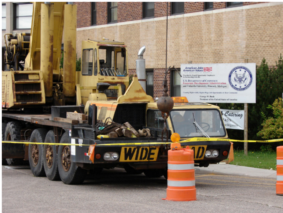
Construction equipment parked outside the Finlandia University Jutula Center

A distinction of the Jutula Center business incubator is the opportunity for collaboration between Finlandia's art and design students and Jutula Center and Smart Zone businesses, as well as